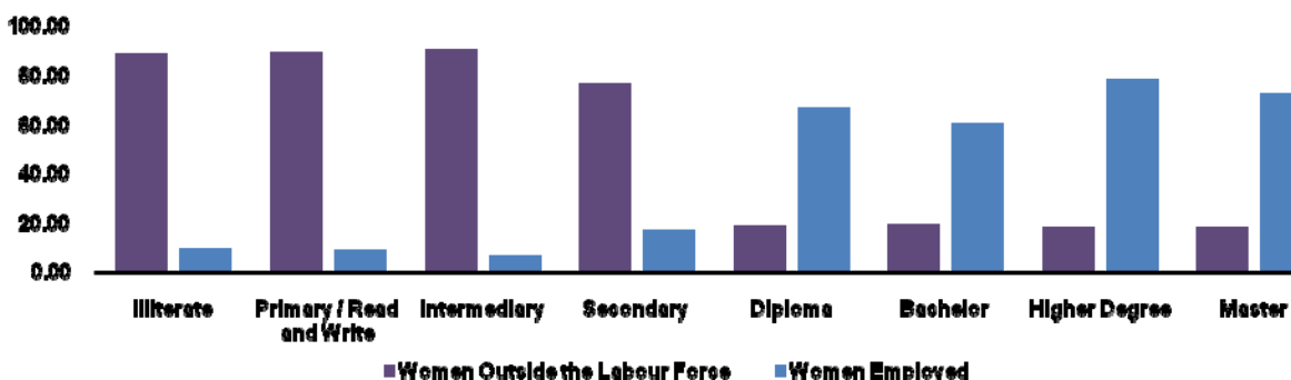
Chart 3: Women Outside the Labour Force vs. Employed according to education level (2008) (% of women 15-64yr. for each level)

COSIT data shows that women without a university education are more likely to be unemployed or not seeking a job (see Chart 3). Only 30% of working age women 13 with a secondary education participate in the labour force, and this figure drops to 10% for those with just a primary education. By contrast, around 80% of university-educated women are seeking a job or employed, and of these most are employed. 14